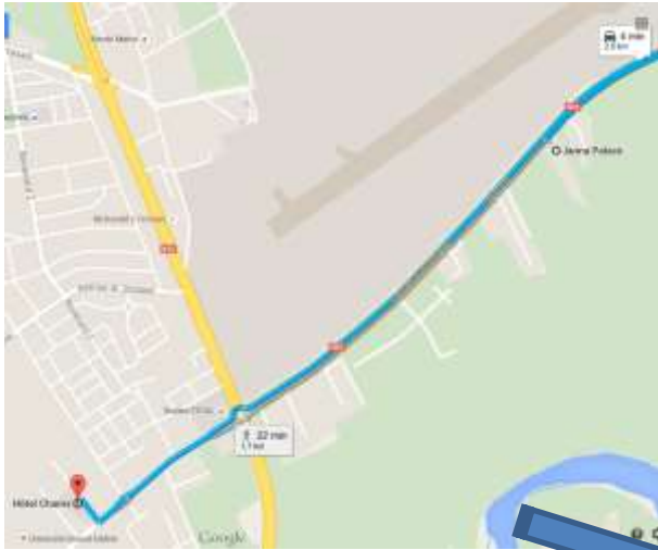
The way : Palais Janna Palace-Hôtel Chams de Tétouan