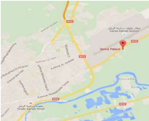
Palais Janna Palace : Lieu de la conférence 3, Route de Martil- Tétouan ; 93002 Maroc