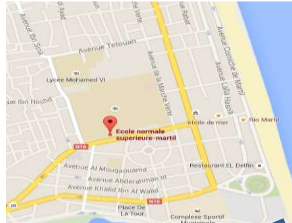
Ecole Normale Supérieure de Tétouan Avenue Hassan II, Martil